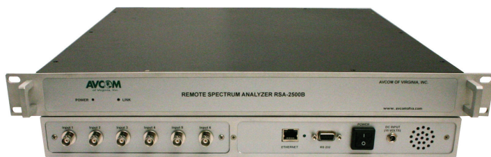
*RSA-2500B6B, 6-input model shown